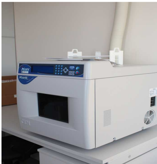
Microwave sample digestion system MARSXpress

High pressure liquid chromatography (HPLC) system Varian ProStar (Varian Corp., USA) with UV/VIS Detector Varian ProStar 325 , Varian ProStar fluorescence detector 363 and mass spectrometer Thermo Scientific, LCQ Fleet .