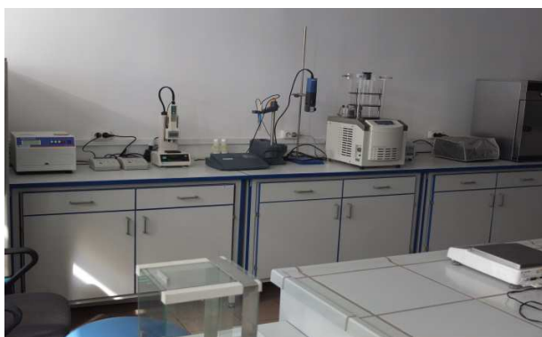
Multifunctional egg tester EMT-5200 , egg shell strength analyzer Egg Shell Force Gauge Modell-II and samples lyophilisator ALPHA 1-2 LD plus