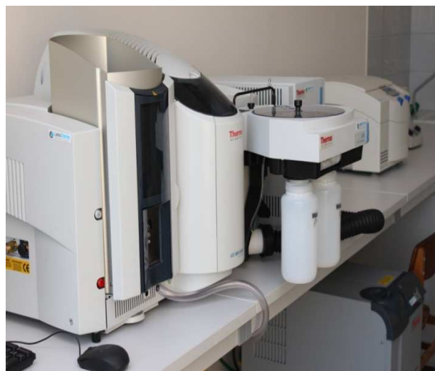
Atomic absorption spectrometry system (AAS)